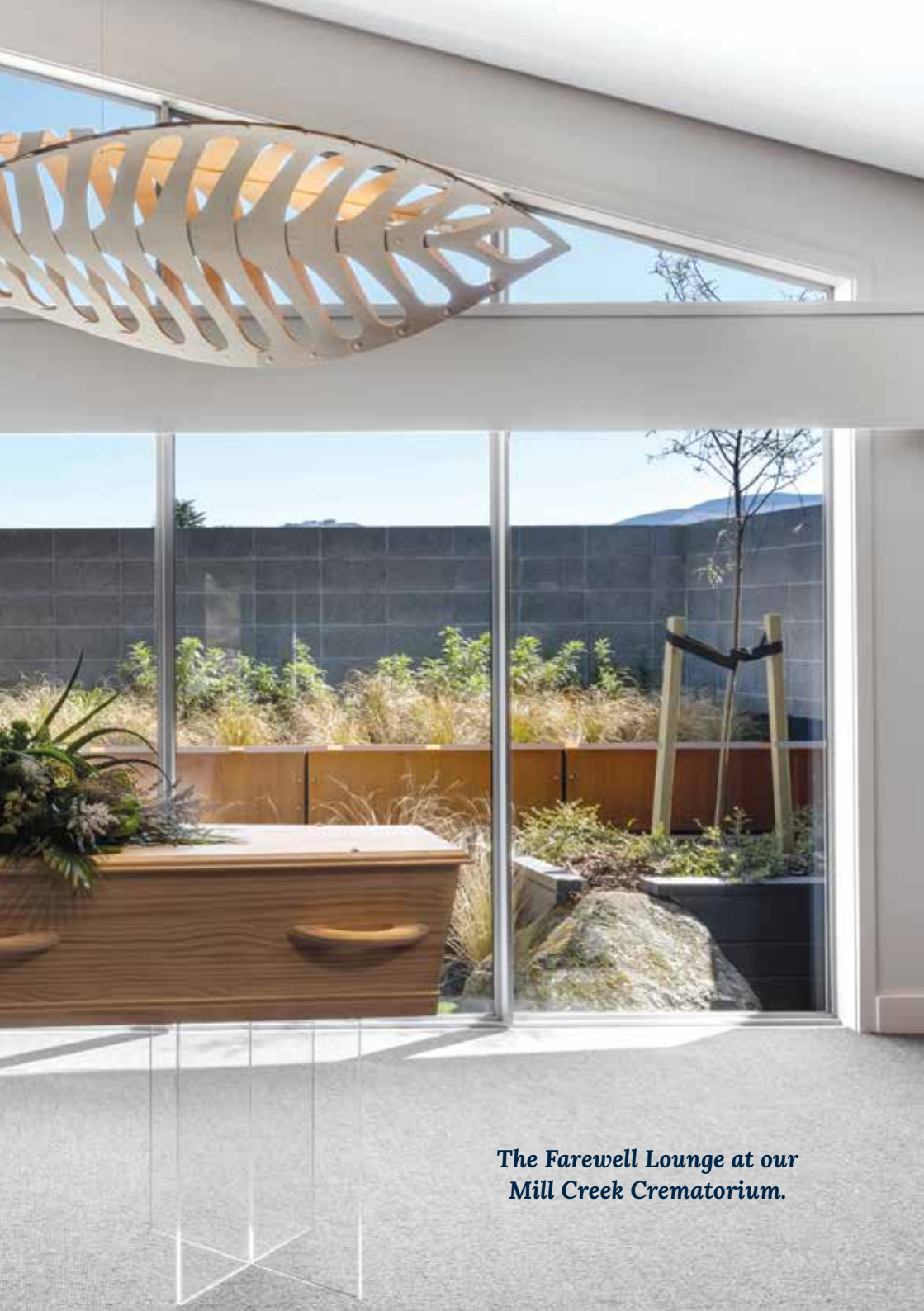
The Farewell Lounge at our Mill Creek Crematorium.